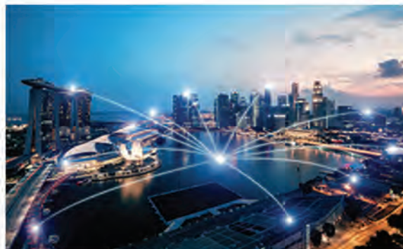
Singapore as a Global Hub

karen.freidhof@ucdenver.edu 303.315.8884 kaela.2.kalabany@ucdenver.edu 303.315.8883